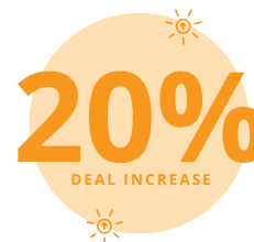
Digitally engaged accounts grew