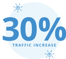
Grew web traffic