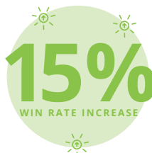
Overall impressions increased